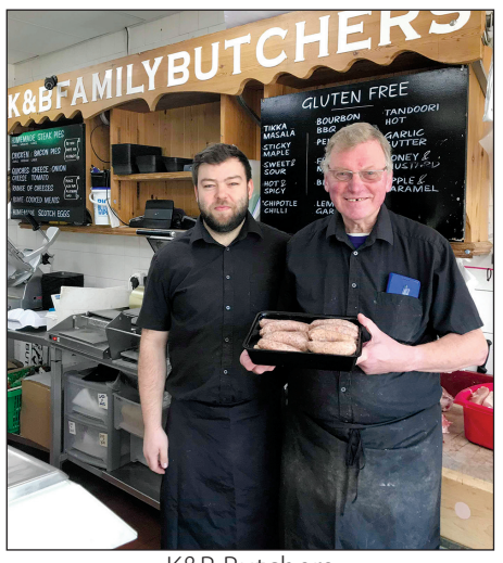
K&B Butchers present their Royal Sausages!